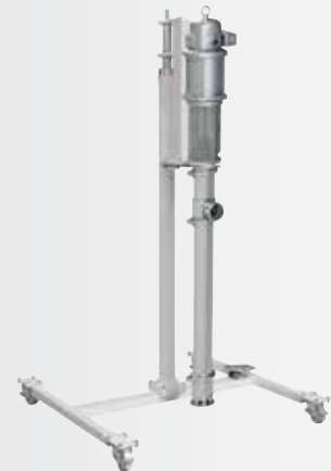
Part No.: 391 026 Pump lift for 220 l (58 gal) drums Pump not included