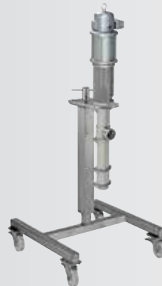
Part No.: 391 027 Pump cart for stub pumps Pump not included